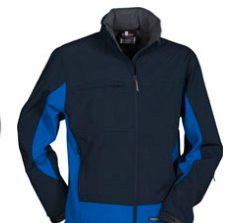
NAVY BLUE/ROYAL BLUE