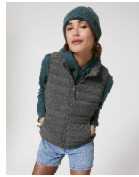
Stella Climber Wool-Like

Shell : Plain Weave Brushed , 100% Polyester - Recycled , Fluorine-free DWR , 140 GSM