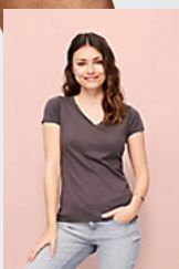
SOL'S MOON 11388

White Dark Aqua Blue Dark blue Kelly green Ash Gold Deep black Navy Grey melange Dark grey Orange Aqua Oxblood