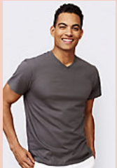
SOL'S VICTORY 11150