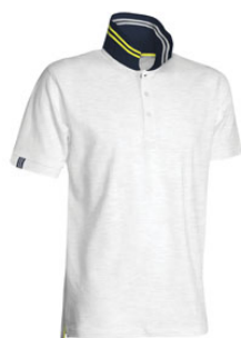
WHITE/NAVY BLUE- WHITE/FLUORESCENT YELLOW