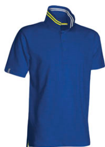
NAUTICAL ROYAL/WHITE- FLUORESCENT YELLOW