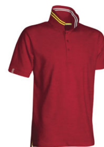
PASSION RED/WHITE- FLUORESCENT YELLOW