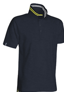
DENIM BLUE/WHITE- FLUORESCENT YELLOW