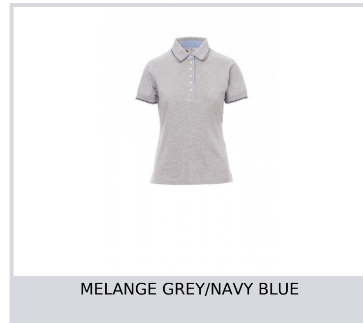
MELANGE GREY/NAVY BLUE