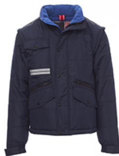
NAVY BLUE/ROYAL BLUE