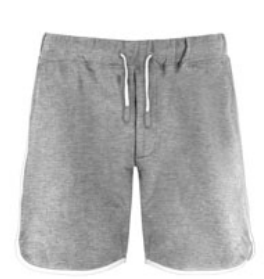
NAVY BLUE/WHITE MELANGE GREY/WHITE CAMOUFLAGE/FLUORE ROYAL BLUE/WHITE SCENT YELLOW